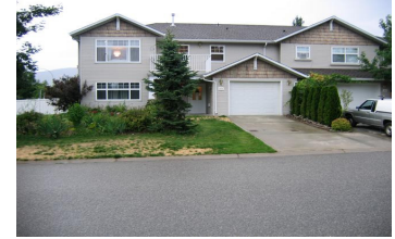
Live Big, Pay Little!

Great location, 3 km to Gellatly Bay Aquatic Park, beach, marina, and boat launch. Features 2 bedrooms, 2 baths on the main floor and 2 bedrooms, 1 bath for your guests in the daylight basement. $375,900 MLS@9198970